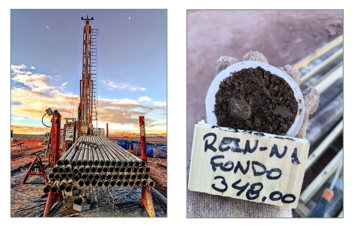
Figure 2. Diamond drilling rig at platform K23 and a representative gravelly sand from K23D40 at 348 m bgs

Notes: <sup>1</sup>SGS laboratory in Buenos Aires, Argentina; <sup>2</sup>Alex Steward laboratory in Salta, Argentina; <sup>3</sup>Average of both SGS laboratory in Buenos Aires, Argentina; 2 Alex Steward laboratory in Jujuy, Argentina.