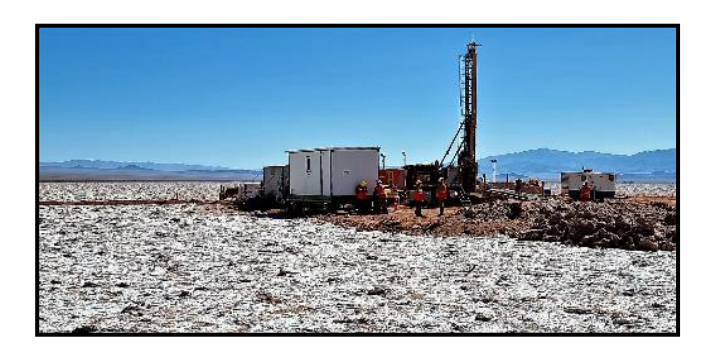
Figure 2: Drilling at Kachi Project

The lithium grade of the Measured resource (0-400 m) across the salar is 212 mg/L lithium, the Indicated resource immediately southeast is 178 mg/l lithium, and the surrounding Inferred resource (0-400 m) has a concentration of 198 mg/L lithium (refer to ASX announcement on 11 January 2023).