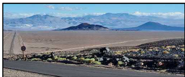
Figure 2: Drilling at Kachi Project; Access Road to site.