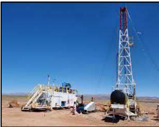
Figure 2: First drillhole at Olaroz Project.

Lake has previously confirmed multiple high-grade lithium brine zones in drilling in 2019 at the Cauchari Project (ASX release 23 Aug 2019). The higher-grade results averaged 493 mg/L lithium over 343m (from 117m to 460m), up to 540 mg/L, which are similar to lithium brines in the adjoining Ganfeng/Lithium Americas JV production development.