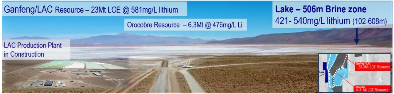
Figure 3. Location of Lake's Cauchari results in relation to the Lithium America's production project.

Lake holds mining leases over 45,000 hectares in two areas in Jujuy Province in NW Argentina, both 100% owned by Lake. Confirmation of multiple high-grade lithium brines over 506m interval (102m to 608m depth) at Lake's 100% owned Cauchari Lithium Brine Project was demonstrated in results returned in late August 2019. This drilling confirmed similar grades and lithium brines extending into Lake's properties from the adjoining Ganfeng/ Lithium Americas Cauchari project (NYSE:LAC), progressing to production in 2021 at 40,000tpa LCE.