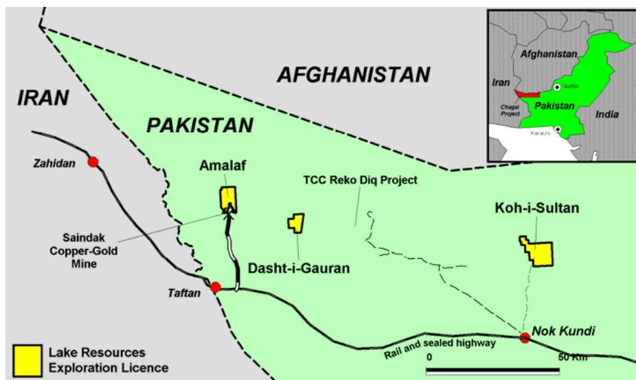
Figure 1: Location and tenement map.

A condition of the new licences is that the Balochistan Government should have up to a 25% interest in the licences – the government previously advised that preparation of a draft agreement was under way.