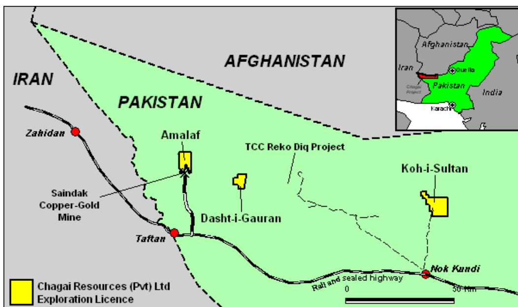
Chagai Project Location Map

Pursuant to these agreements, Lake Resources surrendered its three exploration licences and new exploration licences covering the same areas as the surrendered licences were granted to the Pakistan-incorporated operating entity, Chagai Resources (Pvt.) Limited for a period of 3 years, effective 12 th June 2015. Lake Resources' interest in Chagai Resources is held through a wholly owned Pakistan-incorporated subsidiary, Lake Mining Pakistan (Pvt.) Limited.