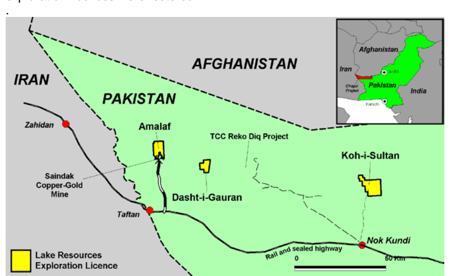
Figure 1: Location and tenement map.

During the September 2013 quarter, the Directorate General of Mines and Minerals, Government of Balochistan, advised that it had cancelled the Company's three exploration licences in Balochistan due to lack of exploration activity. The Company lodged appeals against the cancellations. Following a hearing, the Company was advised in a notice dated 9 January 2014, from the Secretary (Appelate Authority) Mines and Minerals Development Department, Government of Balochistan, that the cancellations had been set aside and the Company's three exploration licences were restored.