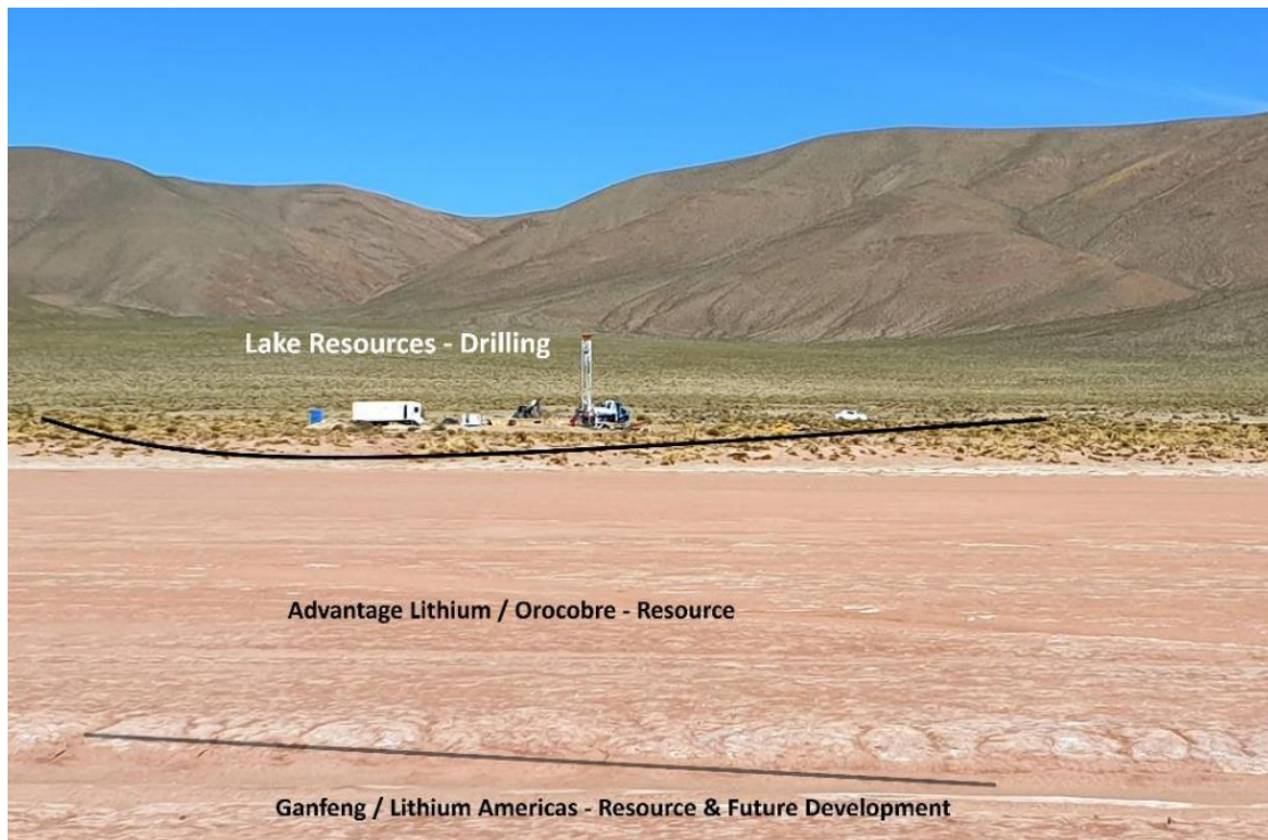
Figure 2: Location of LKE's drill operations at Cauchari in relation to Advantage Lithium/Orocobre & Gangfeng/Lithium Americas leases. (Note: The marked boundaries are indicative only. Please refer to the detailed map).