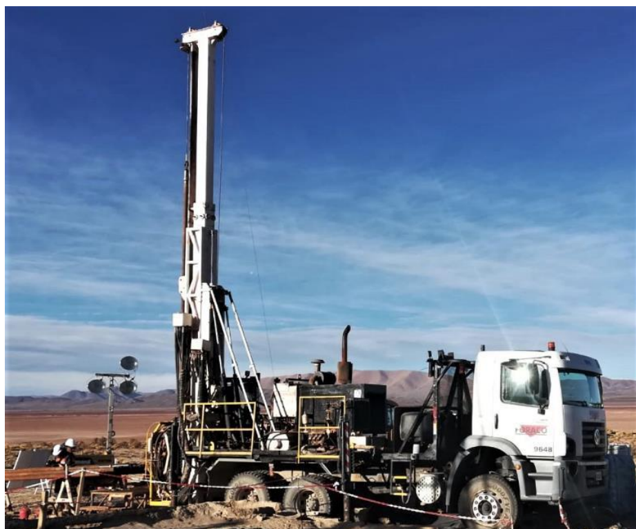
Figure 1: Foraco diamond drill rig at Cauchari looking across salt lake to Ganfeng/Lithium Americas project