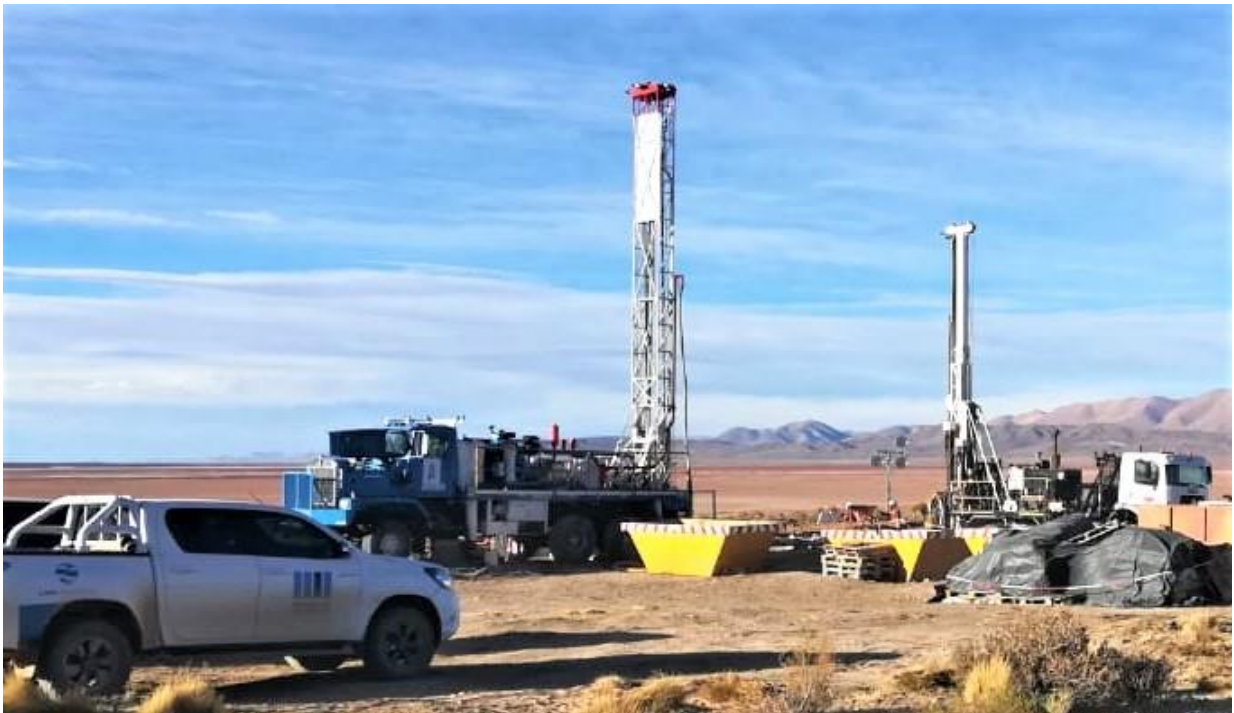
Figure 1: Foraco diamond drill rig at Cauchari (right) with rotary rig (left), looking across salt lake to Ganfeng/Lithium Americas project