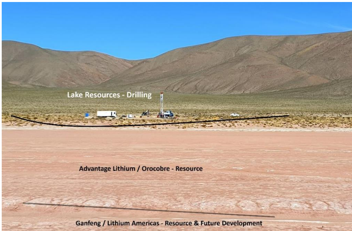
Figure 2: Location of LKE's drill operations at Cauchari in relation to Advantage Lithium/Orocobre & Gangfeng/Lithium Americas leases