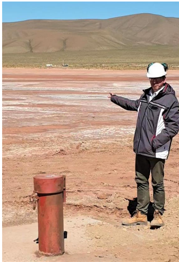
Figure 3: Location of LKE's drill operations at Cauchari to the rear of the photo in relation to a production well soon to be fitted with pumping gear at the Gangfeng/Lithium Americas project assaying 34m at 741 mg/L Lithium from 164m depth.