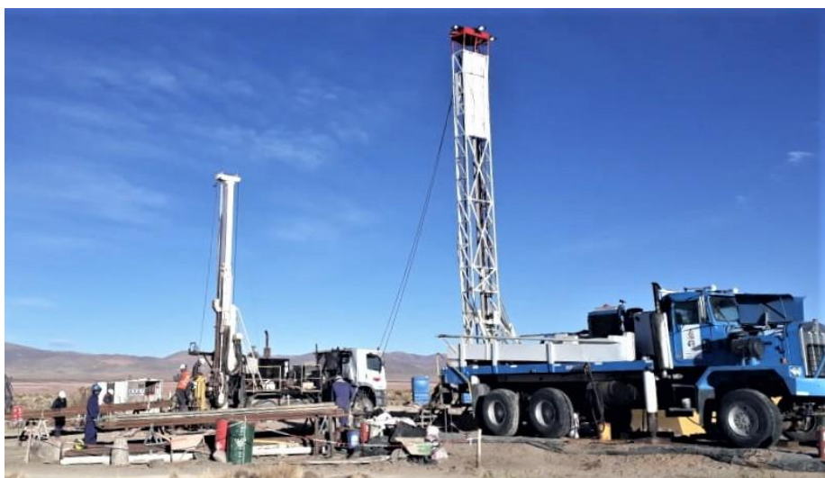
Figure 4: Foraco diamond drill rig (left) next to rotary rig (right) at Cauchari