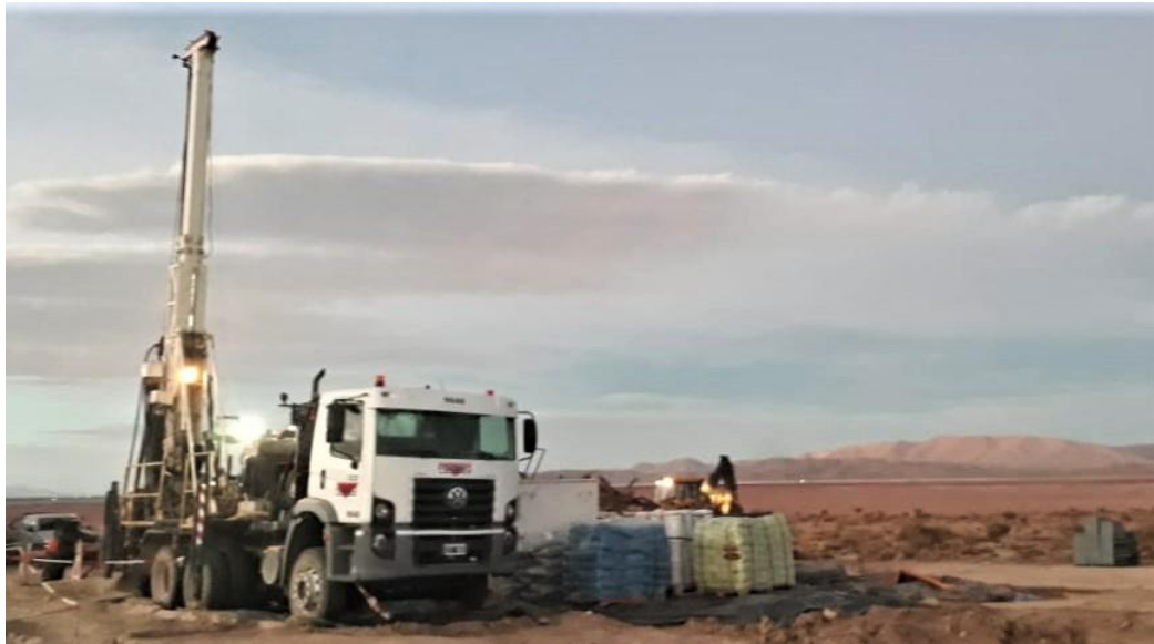
Figure 1: Foraco diamond drill rig at Cauchari, looking across salt lake to Ganfeng/Lithium Americas project