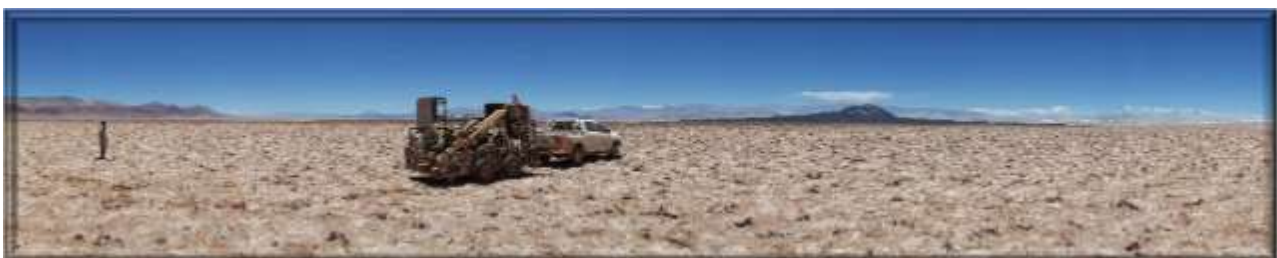
Images of the diamond drill rig at the first drill hole of the Kachi project